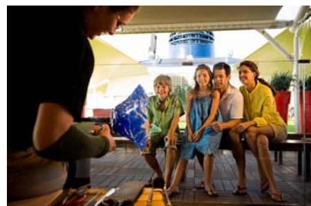
Hot Glass Show